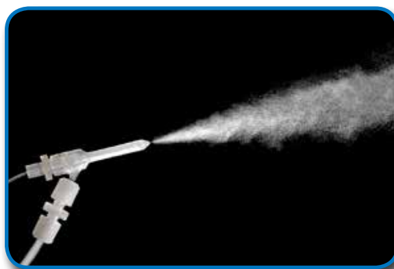
C-Flow PFA Nebulizer

Sample solution is introduced to the Aridus II by a self-aspirating C-Flow PFA Nebulizer. The nebulizer aerosol is sprayed into a heated (up to 110 ^\circ\text{C} ) PFA spray chamber to maintain the sample in a vapor phase. The sample vapor then enters a heated fluoropolymer membrane desolvator module.