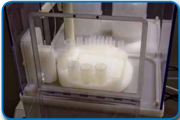
Enclosure door opens for easy access to samples

The ASX-112FR Micro Autosampler includes an integrated enclosure with an easy access front door to allow for easy sample placement within the rotary tray.