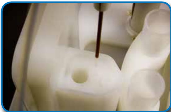
Close-up of ASX-112FR Dual Flowing Rinse Station