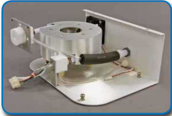
Aridus II Membrane Desolvator Module

The Aridus II is equipped with a modular membrane desolvator (shown below). The module is an integral part of the Aridus II chassis and can be quickly removed or replaced. Once removed from the Aridus II, the membrane desolvator can be conveniently cleaned. A specialized rinse kit is provided to introduce an appropriate cleaning solution such as dilute nitric acid.